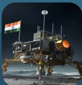
Chandrayaan 3 put to sleep