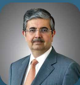
Uday Kotak stepped down

ISSUED BY DEPARTMENT OF PUBLIC POLICY & GOVERNANCE NEWS VILLE CLUB