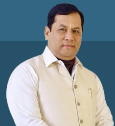
Overseas trade Ports and Shipping