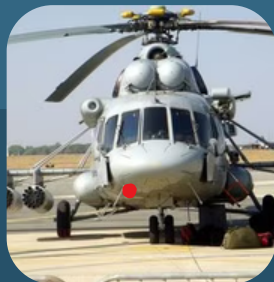
Tata and Airbus's Joint venture