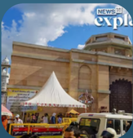
Gyanvapi mosque History and Timeline

ISSUED BY DEPARTMENT OF PUBLIC POLICY & GOVERNANCE NEWS VILLE CLUB