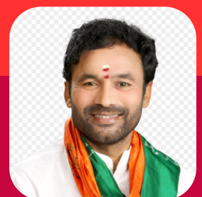
Knowledge Hub MoT