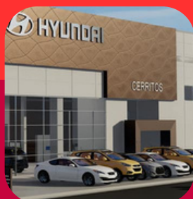
Hyundai India Enters stock market