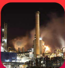
Indian Oil- Adani gas Investment deal

ISSUED BY DEPARTMENT OF PUBLIC POLICY & GOVERNANCE NEWS VILLE CLUB