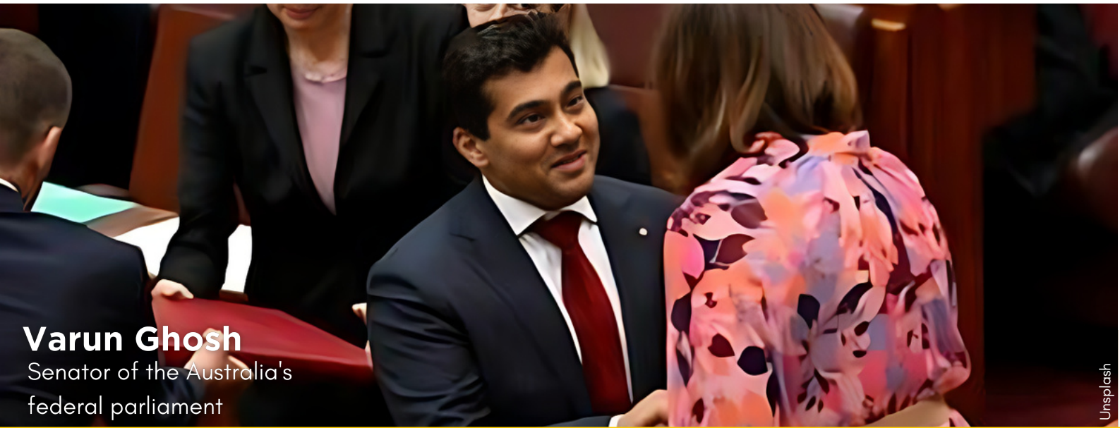
Varun Ghosh Senator of the Australia's federal parliament