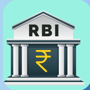
RBI Monetary policy