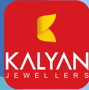
Kalyan Jewellers US Market