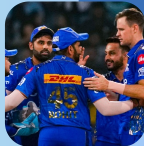
IPL 2024 MI vs DC