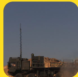
Israel defence exports