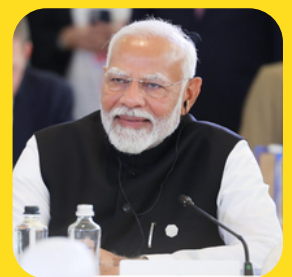
G7 Summit 2024