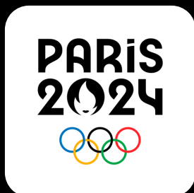
Paris Olympics 2024