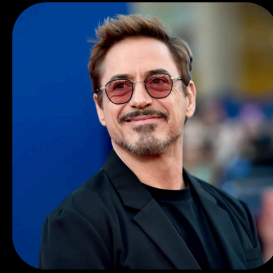
Robert Downey Jr. - Avengers