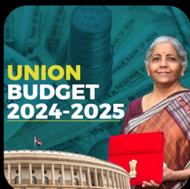
India Budget 2024-2025