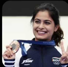
Manu Bhaker - Bronze Medal